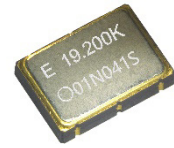
TG-5511CA (4 pins)