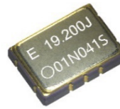
TG-5510CA (10 pins)